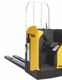
Encloser Rider Pallet MP20-25T 2,000 - 2,500kg