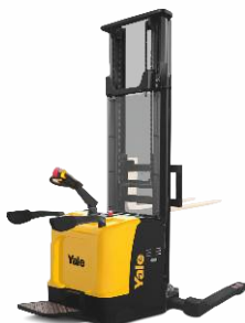
Rider Straddle Stacker MSL15XUX 1,500kg