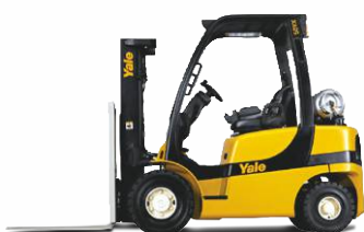
GP40-55VX 4,000 – 5,500kg