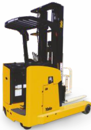
Stand-Up Moving Mast FBR13-18S(W)Z, FBR20-30SZ 1,250 - 3,000kg