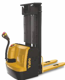
Walkie Stacker MS15UX 1,500kg