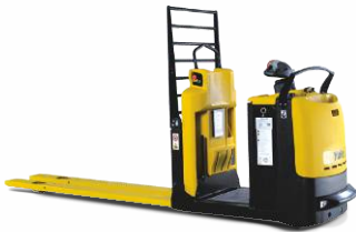
Low Level Order Picker M020-25 2,000 - 2,500kg