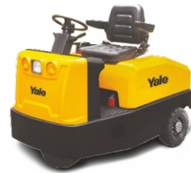
Sit-Down MT30UX 3,000kg