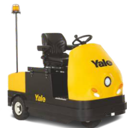
Sit-Down MT70-80 7,000 - 8,000kg

No matter how big or small your warehouse