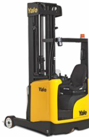
Sit-Down Moving Mast MR10-14E, MR14-25 1,000 - 2,500kg