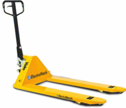
Pallet Jack YPT25 2500kg