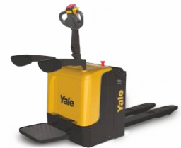
Rider Pallet MP20XUX 2,000kg