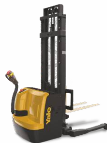
Walkie Straddle Stacker MSL15WUX 1,500kg