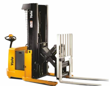
Walkie Reach Stacker MRW020-030E 900 - 1,350kg