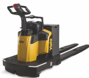
Rider Pallet MPE060-080VH 2,700 - 3,600kg