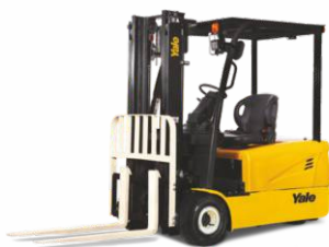
3 Wheel ERP16-20UXT 1,600 - 2,000kg