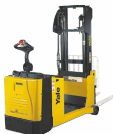
Walkie CB Stacker MC10-15 1,000 - 1,500kg