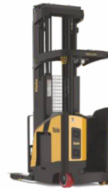
Stand-Up Moving Single Double Reach NR/NDR030-045EC, NR/NDR030-040DC 1,360 - 2,041kg