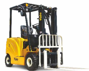
4 Wheel ERP15-35UX 1,500 - 3,500kg