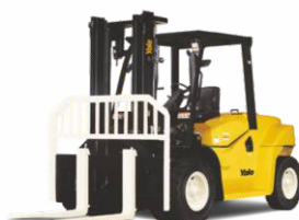
GP50-70UX6 5,000 – 7,000kg