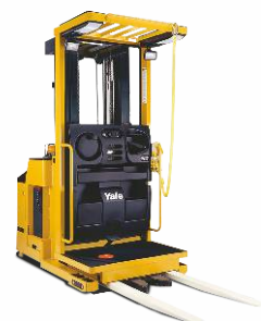
Mid-High Order Picker OS030EF/BF, SS030BF, FS030BF 1,350kg