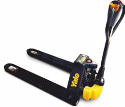
Walkie MPC15 1,500kg