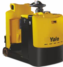
Stand-Up M050T, M070T 5,000 - 7,000kg