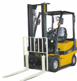
GP16-20SVX 1,600 – 2,000kg