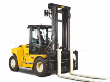
GDP80-160DF/EF 8,000 – 16,000kg