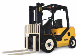
GP20-35UX 2,000 – 3,500kg