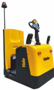
Stand-Up MT30XUX 3,000kg