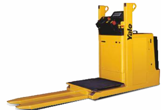
Low/Mid Order Picker M010E AC 1,000kg