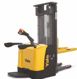
Rider Stacker MS15XUX 1,500kg