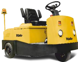
Sit-Down MT60UX 6,000kg