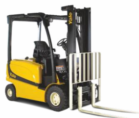
4 Wheel ERP16-20VF/ERP030-040VF 1,600 - 2,000kg