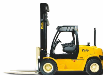
GP135-155VX 6,000 – 7,000kg