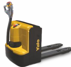
Walkie MP20KUX 2,000kg