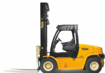
4 Wheel ERP70-90VNL 7,000 - 9,000kg