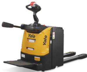
Rider Pallet MP20X 2,000kg