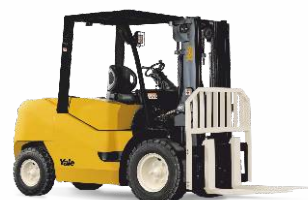
GP40-50UX 4,000 – 5,000kg