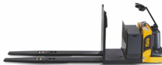
Low Level Order Picker MPC 060-080-VG 2,700 - 3,600kg