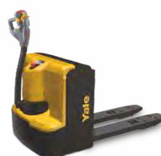
Walkie MP20KUX 2,000kg