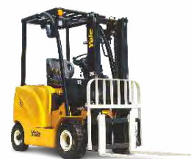
4 Wheel ERP15-35UX 1,500 - 3,500kg