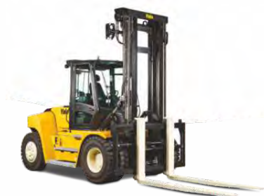
GDP80-160DF/EF 8,000 – 16,000kg