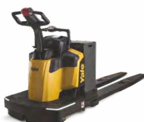
Rider Pallet MPE060-080VH 2,700 - 3,600kg