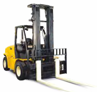
GP170-190VX 8,000 – 9,000kg