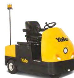
Sit-Down MT70-80 7,000 - 8,000kg

No matter how big or small your warehouse