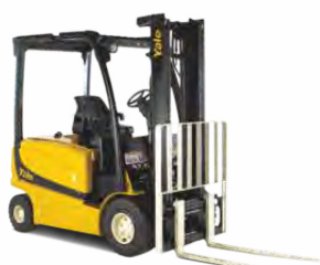
4 Wheel ERP22-35VL 2,200 - 3,500kg