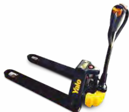
Walkie MPC15 1,500kg