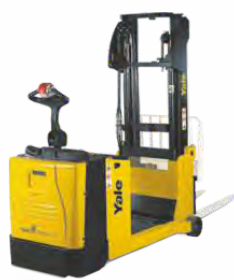
Walkie CB Stacker MC10-15 1,000 - 1,500kg