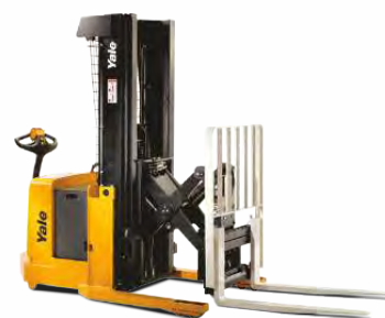
Walkie Reach Stacker MRW020-030E 900 - 1,350kg