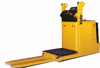
Low/Mid Order Picker M010E AC 1,000kg