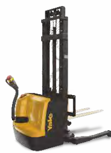
Walkie Straddle Stacker MSL15WUX 1,500kg