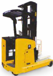
Stand-Up Moving Mast FBR13-18S(W)Z, FBR20-30SZ 1,250 - 3,000kg