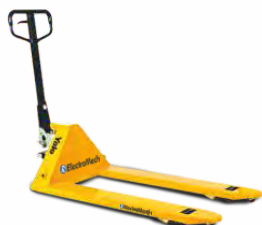
Pallet Jack YPT25 2500kg