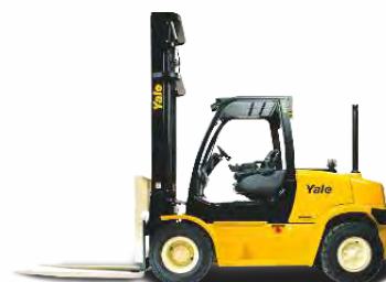
GP135-155VX 6,000 – 7,000kg