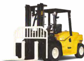
GP50-70UX6 5,000 – 7,000kg