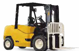
GP40-50UX 4,000 – 5,000kg