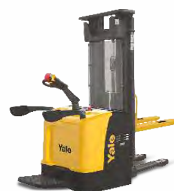
Rider Stacker MS15XUX 1,500kg