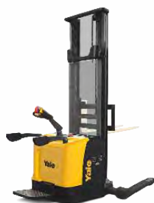
Rider Straddle Stacker MSL15XUX 1,500kg