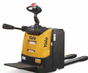
Rider Pallet MP20X 2,000kg