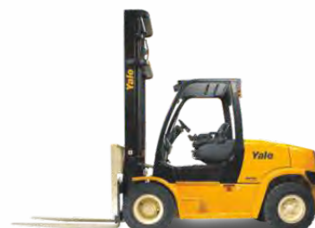
4 Wheel ERP70-90VNL 7,000 - 9,000kg