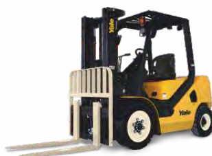
GP20-35UX 2,000 – 3,500kg