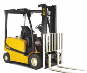
4 Wheel ERP16-20VF/ERP030-040VF 1,600 - 2,000kg