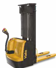
Walkie Stacker MS15UX 1,500kg