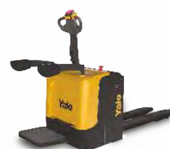
Rider Pallet MP20XUX 2,000kg