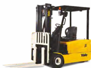
3 Wheel ERP16-20UXT 1,600 - 2,000kg