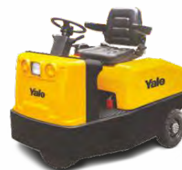
Sit-Down MT30UX 3,000kg