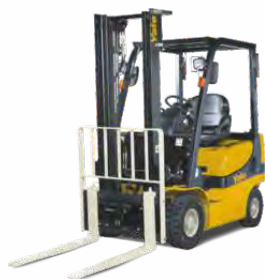
GP16-20SVX 1,600 – 2,000kg