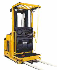
Mid-High Order Picker OS030EF/BF, SS030BF, FS030BF 1,350kg