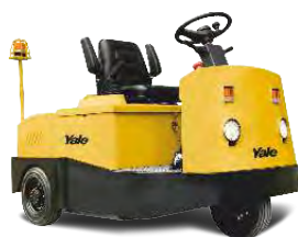
Sit-Down MT60UX 6,000kg