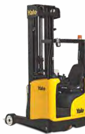
Sit-Down Moving Mast MR10-14E, MR14-25 1,000 - 2,500kg