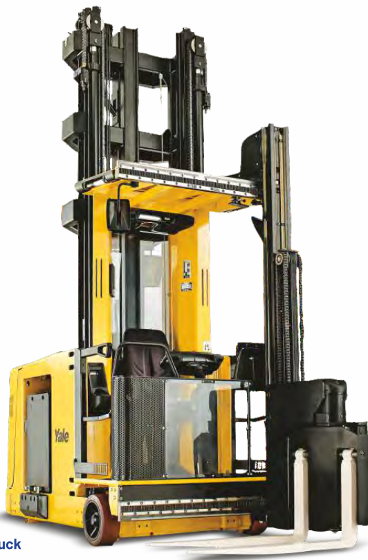
Man-Up Turret Truck MTC10-15L 1,000 - 1,500kg