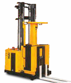
Mid-High Order Picker M010S 1,000kg