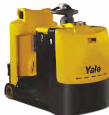
Stand-Up M050T, M070T 5,000 - 7,000kg