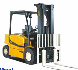
4 Wheel ERP40-55VM 4,000 - 5,500kg