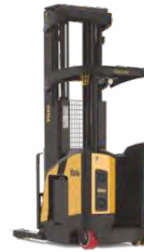
Stand-Up Moving Single Double Reach NR/NDR030-045EC, NR/NDR030-040DC 1,360 - 2,041kg