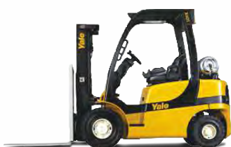
GP40-55VX 4,000 – 5,500kg