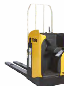
Encloser Rider Pallet MP20-25T 2,000 - 2,500kg