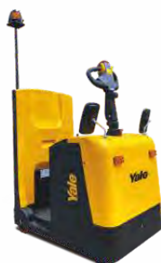
Stand-Up MT30XUX 3,000kg