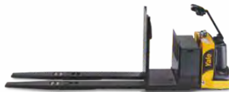
Low Level Order Picker MPC 060-080-VG 2,700 - 3,600kg