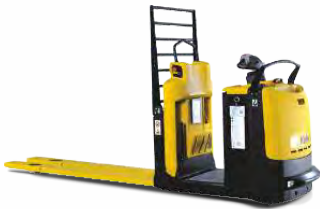
Low Level Order Picker M020-25 2,000 - 2,500kg