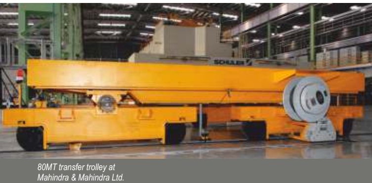
80MT transfer trolley at Mahindra & Mahindra Ltd.