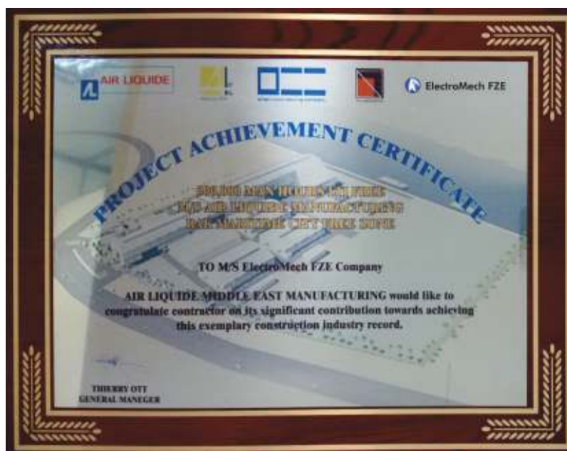
Project Achievement Certificate awarded to ElectroMech by Air Liquide