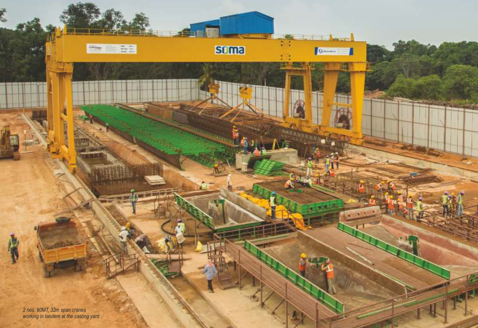
2 nos. 80MT, 32m span cranes working in tandem at the casting yard