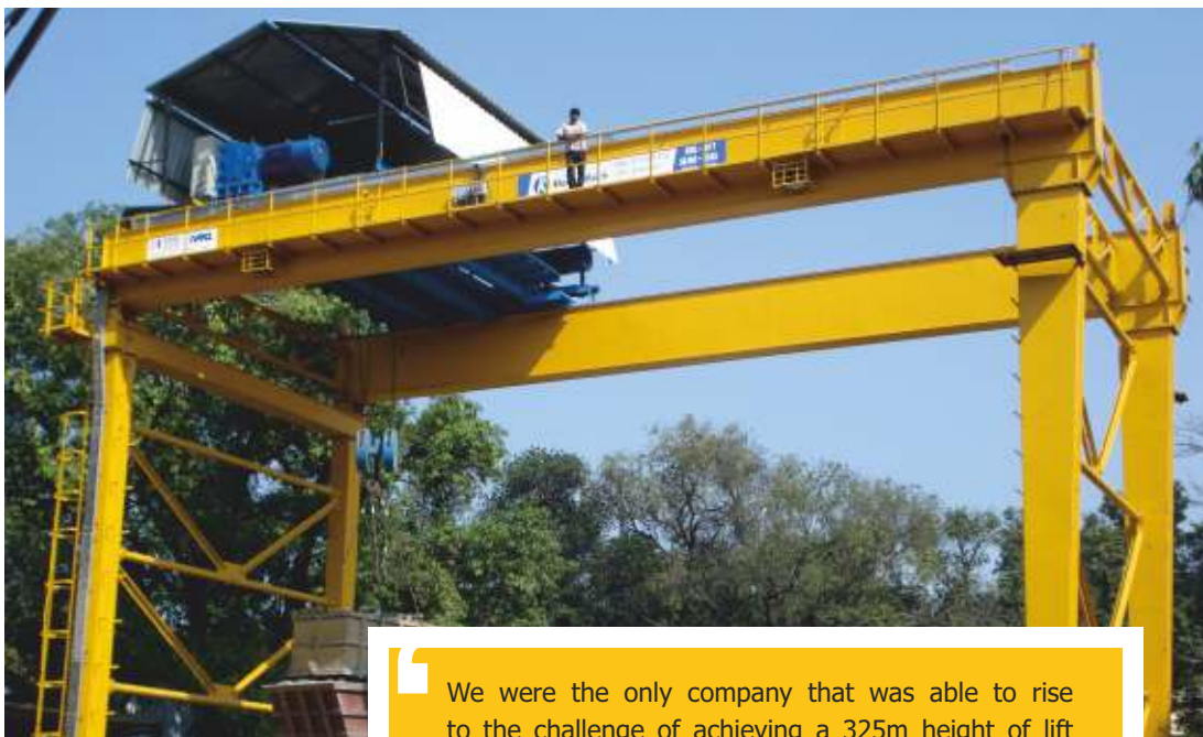
32MT, 18.7m span, high-speed, high-lift tunnel mucking crane supplied to Unity-IVRCL JV

ElectroMech has always been a leader in innovation and has stepped forth to meet every handling challenge, be it in infrastructure projects or manufacturing establishments. The solutions provided by ElectroMech have always been unique and engineered to perfection. Over the years, these innovations have been appreciated across several factories and projects across India and the world. These projects and their success is the real award that ElectroMech takes pride in, but along the way recognition from other organisations goes a long way in encouraging us to take on more challenges.