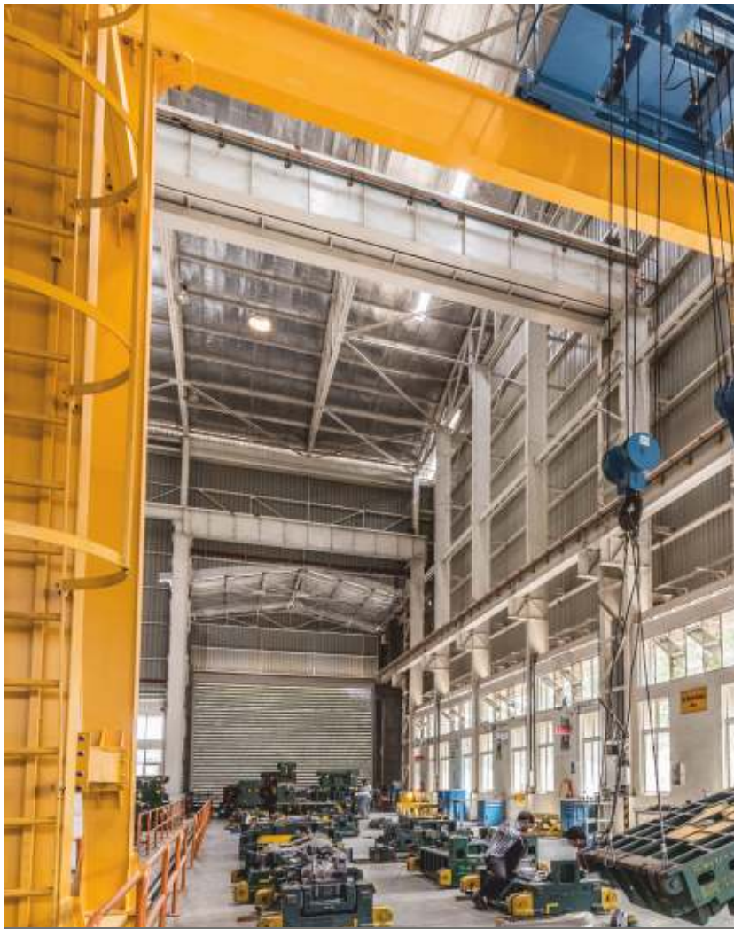
Die tilting operation at Bajaj Auto Ltd., Aurangabad