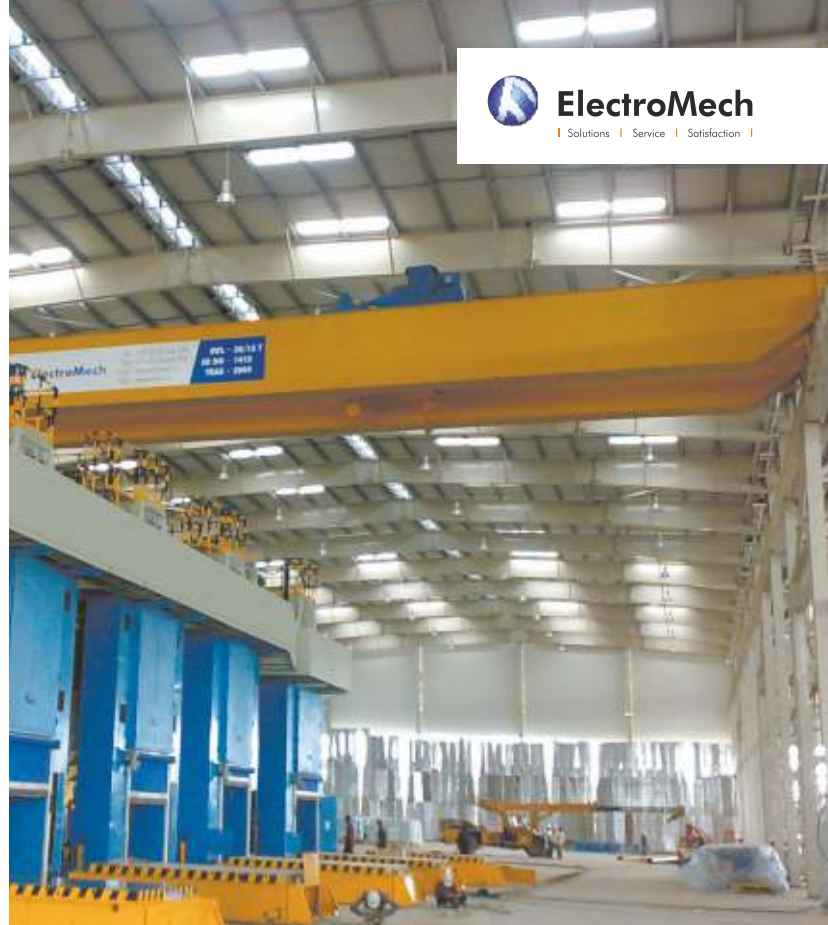
50/15MT, 34.5m span Abus double girder crane at Gestamp, Pune for stamping of vehicle doors