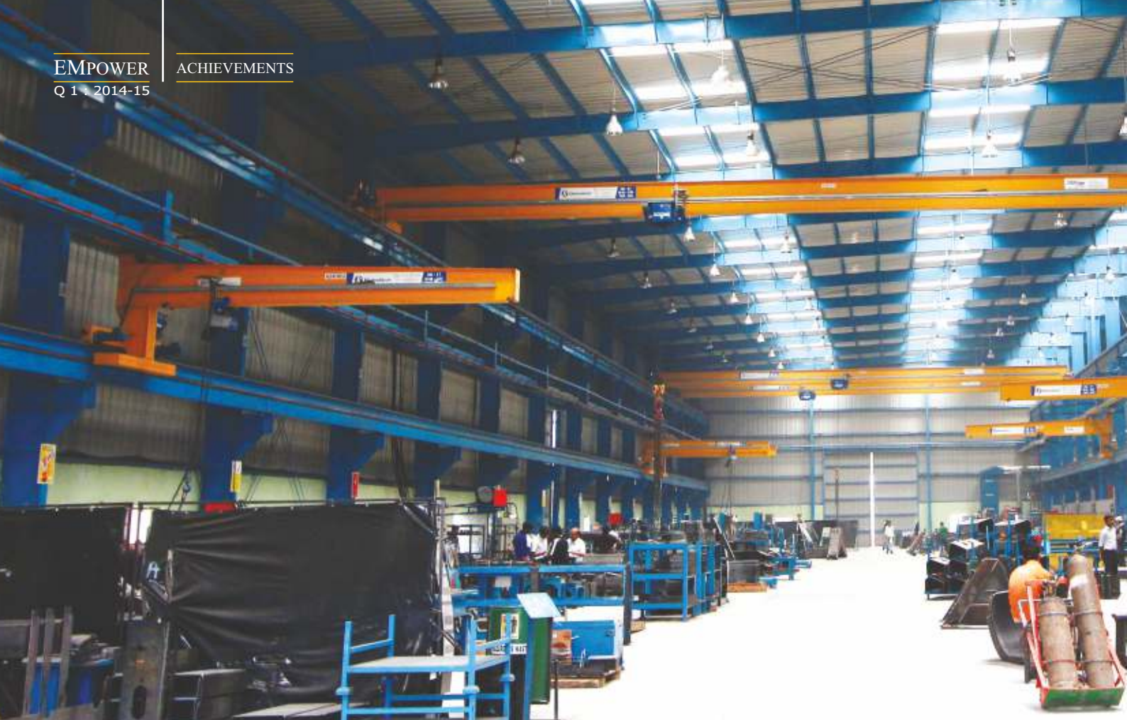
Various ElectroMech & Abus cranes at Apex Auto Ltd., Bangalore for manufacturing and handling construction equipment parts