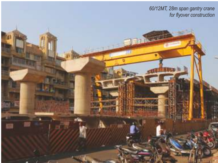
60/12MT, 28m span gantry crane for flyover construction

After globetrotting, proud to be a part of a project in our hometown