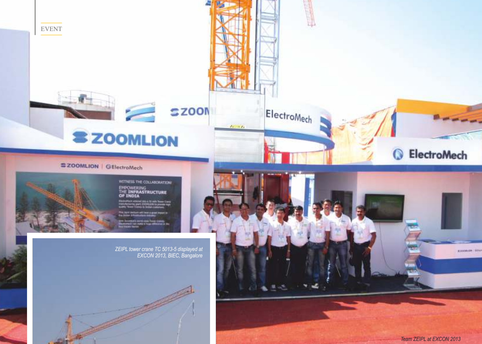
ZEPL tower crane TC 5013-5 displayed at EXCON 2013, BIEC, Bangalore