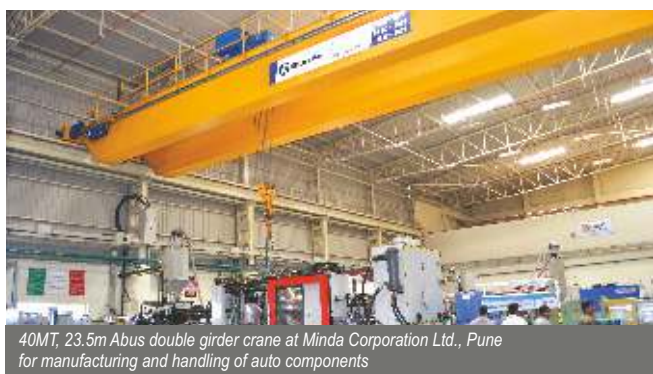
40MT, 23.5m Abus double girder crane at Minda Corporation Ltd., Pune for manufacturing and handling of auto components