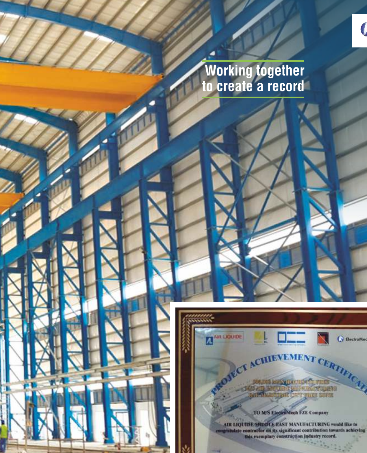
Load testing of 150MT double girder crane at the Air Liquide facility in Ras Al-Khaimah, UAE