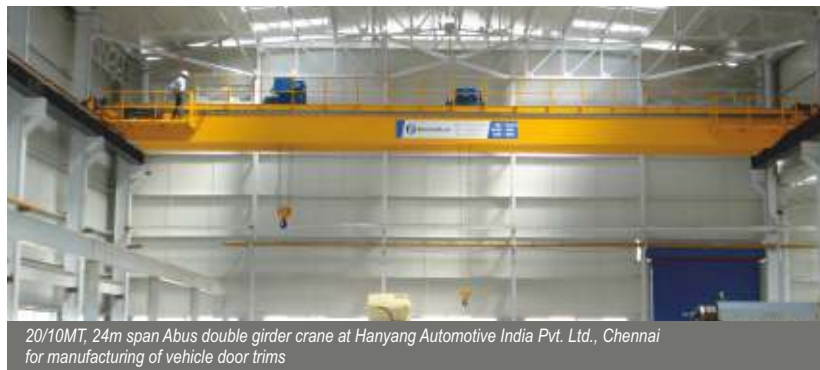
20/10MT, 24m span Abus double girder crane at Hanyang Automotive India Pvt. Ltd., Chennai for manufacturing of vehicle door trims