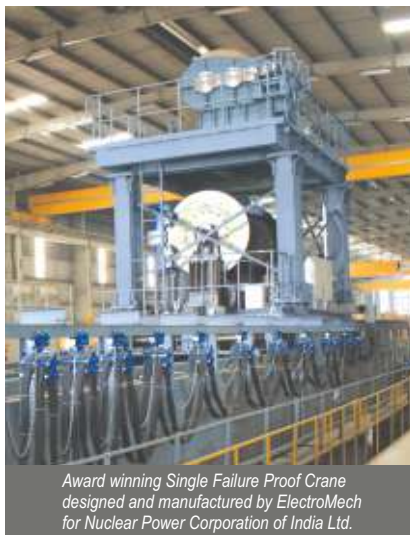
Award winning Single Failure Proof Crane designed and manufactured by ElectroMech for Nuclear Power Corporation of India Ltd.

We received this award for the indigenous development of a Single Failure Proof Crane (SFP) for Nuclear Power Corporation of India Ltd. (NPCIL). SFP cranes are installed at extremely critical locations in a nuclear power plant such as the reactor dome directly above the reactor and the spent fuel storage bay. Clearly, safety is of utmost importance in these areas. To avoid any accidents, the crane is provided with redundant safety mechanisms to ensure safety. This is achieved through a dual wire rope and drum arrangement as well as redundant mechanisms for critical systems.