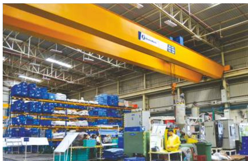
40MT, 23.5m span Abus double girder crane at Minda Corporation Ltd. Pune for manufacturing and handling of auto components