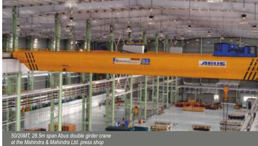
50/20MT, 28.5m span Abus double girder crane at the Mahindra & Mahindra Ltd. press shop

Considering the various options of crane systems in different load capacities available with ElectroMech, a number of leading automobile manufacturers and tier 1 & tier 2 suppliers trust us for their handling requirements. Here are a few of our satisfied customers.