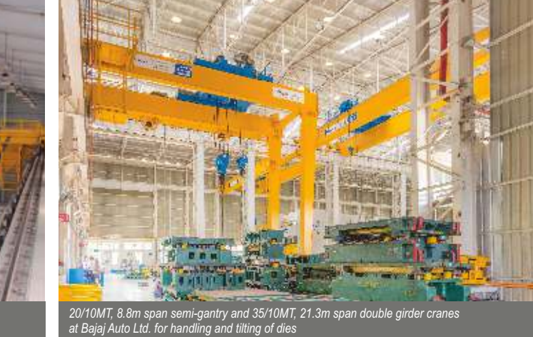
20/10MT, 8.8m span semi-gantry and 35/10MT, 21.3m span double girder cranes at Bajaj Auto Ltd. for handling and tilting of dies