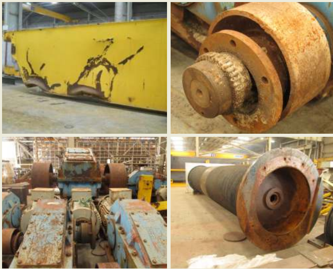
The damaged crane