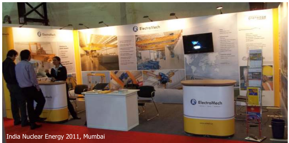
India Nuclear Energy 2011, Mumbai

India Nuclear Energy Summit 2011 was held in Mumbai from September 29 to October 1, 2011. This was visited by several eminent delegates from the power sector. ElectroMech's complete range of cranes suitable for nuclear, thermal, wind and hydro electric projects was showcased during the show and received good attention of visitors from different companies in the power sector.